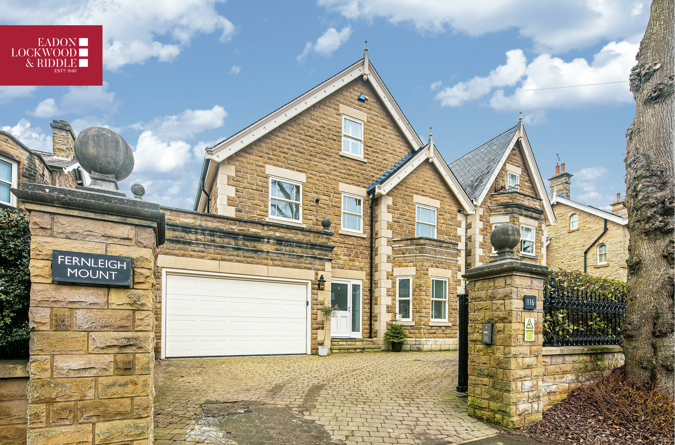
Fernleigh Mount, 116 Totley Brook Road, Sheffield, S17 3QU